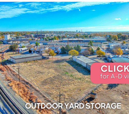
OUTDOOR YARD STORAGE